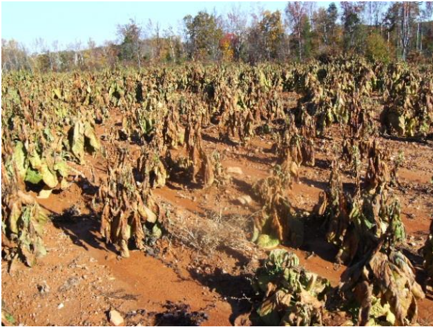
Conventionally fertilized tobacco