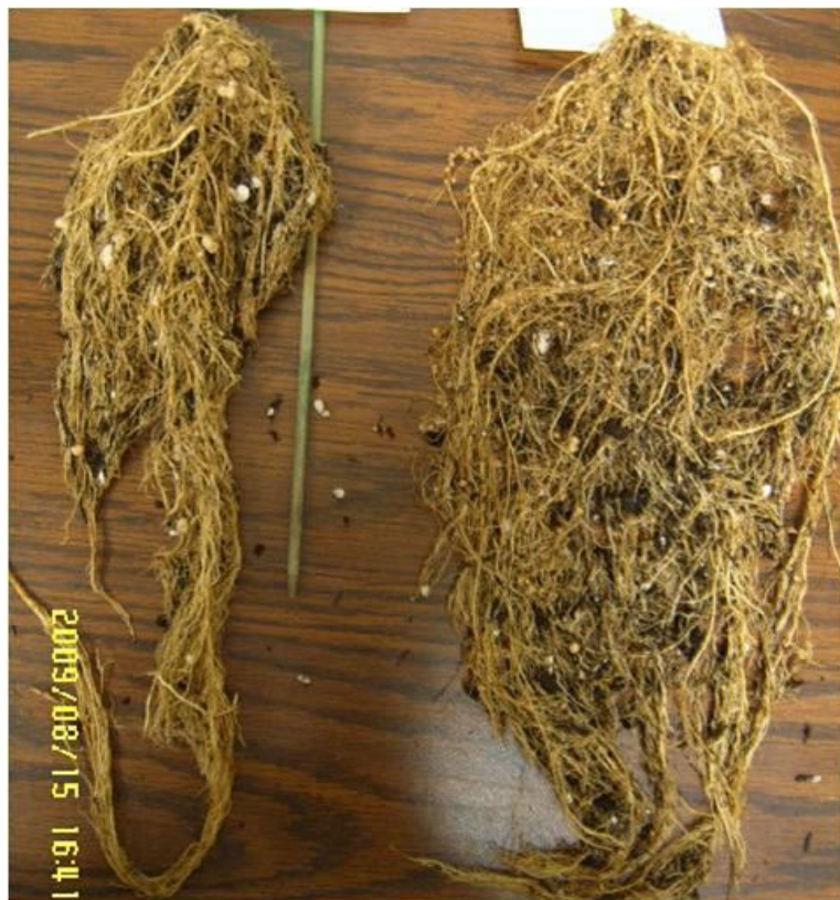
Conventionally fertilized roots on left, SumaGrow tm product roots on right.

Below is a picture of control versus SumaGrow tm treated soybean roots which is featured in a Forbes.com article.