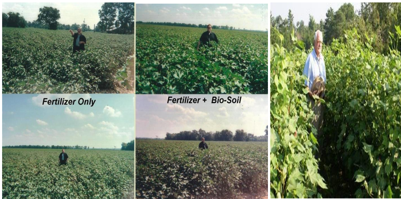
Left -- Below the waist without BSEI

The cotton plot below (center) missed the recommended first treatment and only received the second treatment. It was late in showing a difference between the treated and control acreage; however, the difference by the end of the season was significant. The crop exhibited a deeper and more extensive root system; thicker stalks, taller plants and a deeper green color. The crop proved to withstand stresses better as a wind storm near the end of the season blew down the control crop, yet the treated portion withstood the wind and was able to be harvested one week earlier (which received a higher price at the cotton gin) than the control crop. The treated portion generated an additional 8% of ginned cotton (lint) per acre as well as a significantly greater seed quantity.