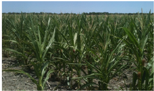
SumaGrown corn during drought conditions