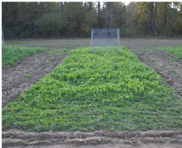
Tecomate Max Attract 50/50 with 13/13/13 Fertilizer

It is worth noting these Tecomate food plot tests were conducted in 2007 using an earlier version of SumaGrow tm product, which has since been improved, hence, additional fertilizer reductions may currently increase the yield further.