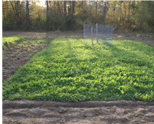
Tecomate Max Attract 50/50 with SumaGrow tm (no fertilizer)