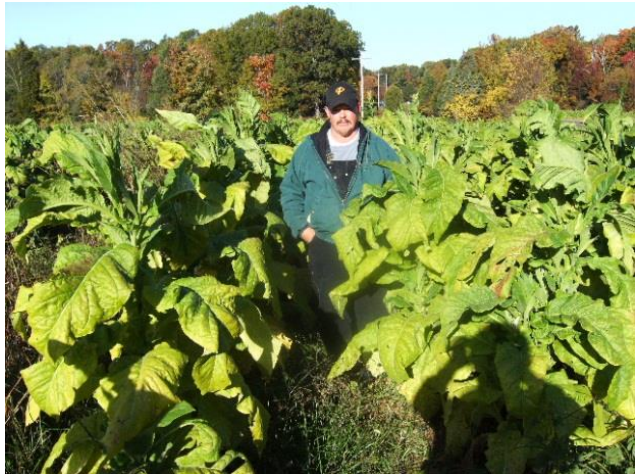
SumaGrown tobacco on the same farm

Not only did the tobacco, treated only with manure and a product containing SumaGrow tm , withstand several frosts, the tobacco buyer stated it was the “biggest and best tobacco he had ever seen.”