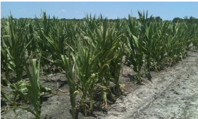
Conventionally fertilized corn during drought conditions

Below are pictures from a severe drought area of Texas in 2011 showing conventionally fertilized corn versus SumaGrow tm treated corn. The untreated corn, on the left, has a noticeable lack of germination and if you look closely, no ears of corn, while the SumaGrown corn on the right has a much higher germination rate and at least one ear of corn on nearly every stalk.