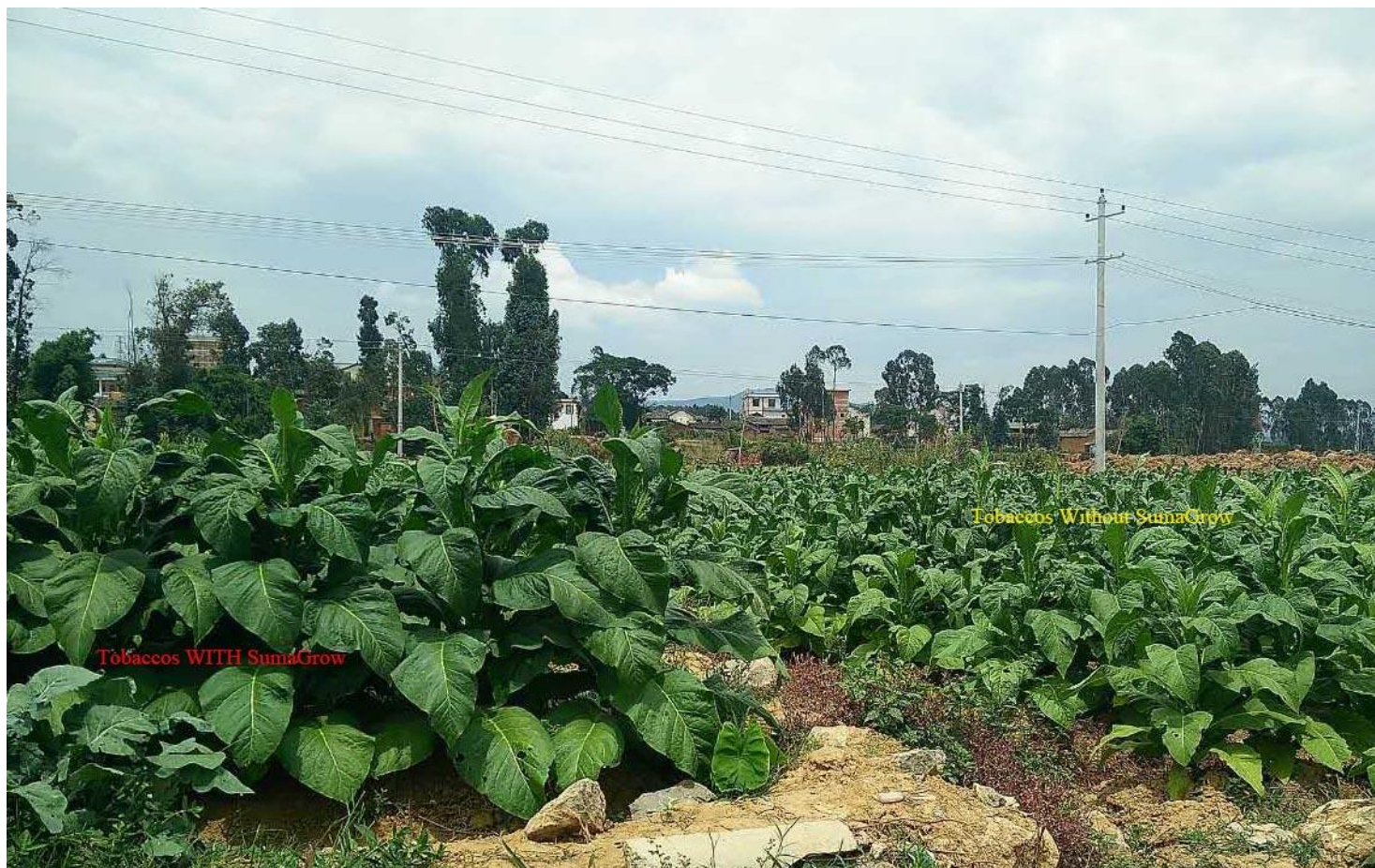
Tobaccos 90days, on the left side: Tobaccos with SumaGrow, on the right side: Tobaccos without SumaGrow

REMARKS: 2 nd application of the Earthcare with SumaGrow was applied 30 days after the 1 st application, 60 days after the tobaccos were planted. Test site inspection was conducted 30days after the 2 nd application, 90days after the tobacco were planted, bigger leaf size, dark green color, faster growing and taller of the plants were observed in the test field.