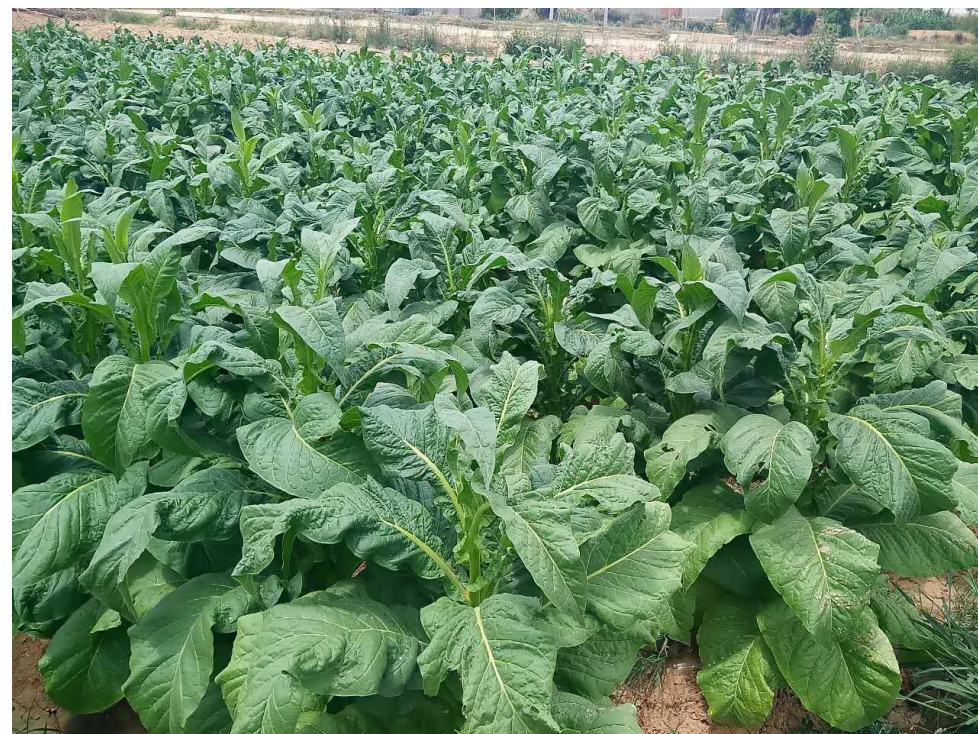
Tobaccos 90days WITH SumaGrow (W3)