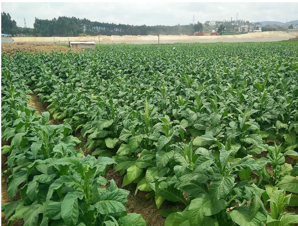
Tobaccos 90days W/O SumaGrow (3)