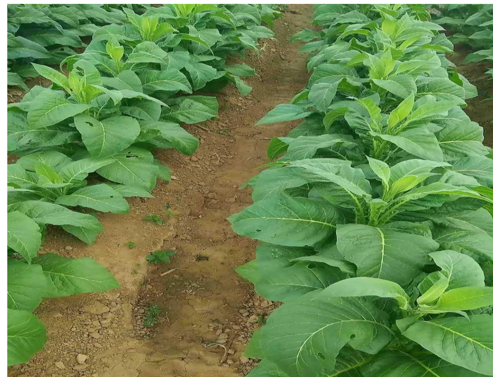
Tobaccos 60days WITH SumaGrow (W2)

REMARKS: 1 st application of the Earthcare with SumaGrow was applied 30 days after tobaccos were planted. Test site inspection was conducted 30days after the 1 st application, 60days after the tobaccos were planted, bigger leaf size, dark green color and faster growing of the plants were observed in the test field (Pictures W1, W2).