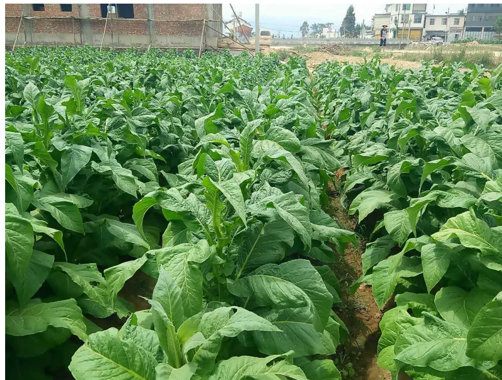
Tobaccos 60days WITH SumaGrow (W1)