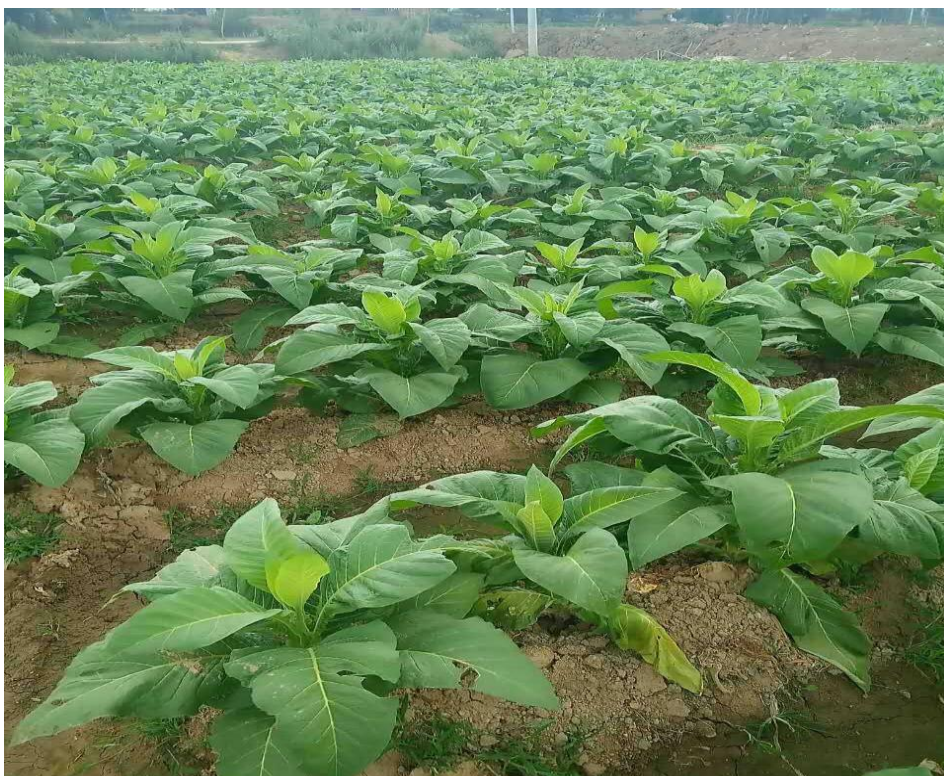
Tobaccos 60days W/O SumaGrow (2)