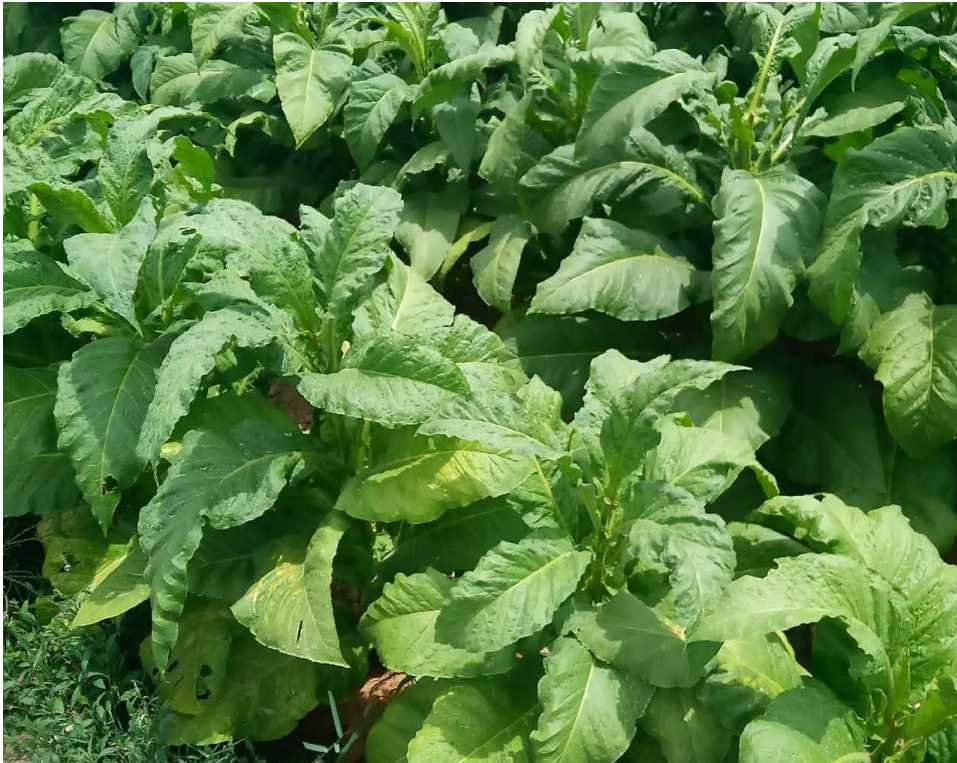
Tobaccos 90days W/O SumaGrow (4)