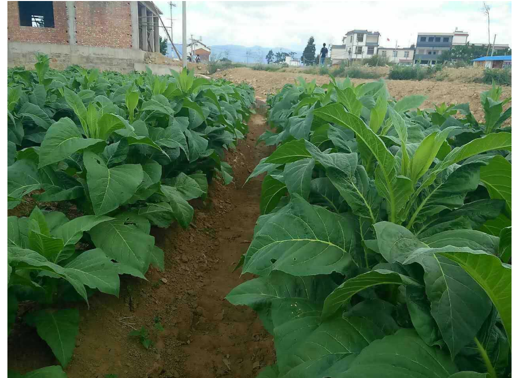
Tobaccos 90days WITH SumaGrow (W4)